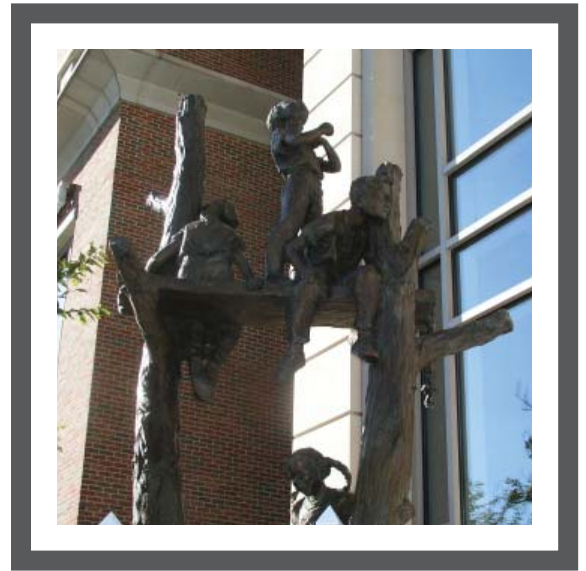
6. New Heights by Jane DeDecker 2001 (Bronze) Corner of Brentwood and Forsyth at Shaw Park Plaza Commissioned by Trammel Crow

Streamlined, poised in space, the six almost life-size figures radiate from a cube—the shiny surfaces capture the ever-changing street life. Mounted on a black granite tiered base, the sculpture explores Trova’s falling man motif that he began developing in the 1960s. Featureless, without arms, the figures construct a dramatic space that we are invited to enter. This piece is one in a series of nine.