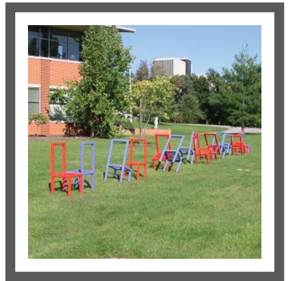
8. Dancing Chairs by Rod Baer 1998 (Welded and painted steel) Moved to Clayton School District in 2001

Capturing and activating space, a large conical form becomes a beacon sitting atop cascading aluminum sheets, ribbons, and a grid—the calligraphic energy is grounded in a circular space. It also seems to reach out to spaces beyond. A creator of large-scale semi-architectural pieces, Ayccock developed this commissioned work to reflect both the surrounding buildings as well as the activities that take place within them.