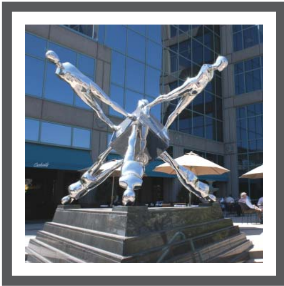
5. FM6 Walking Jackman by Ernest Trova 1985 (Stainless steel) Corner of Brentwood and Maryland

Streamlined, poised in space, the six almost life-size figures radiate from a cube—the shiny surfaces capture the ever-changing street life. Mounted on a black granite tiered base, the sculpture explores Trova’s falling man motif that he began developing in the 1960s. Featureless, without arms, the figures construct a dramatic space that we are invited to enter. This piece is one in a series of nine.