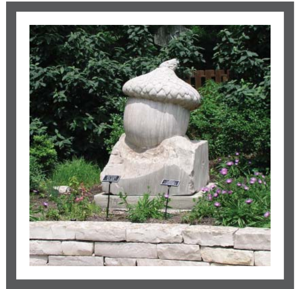
12. Youth by Todd Frahm 2003 [Carved Bedford limestone] In Wydown Park just east of Hanley/Wydown intersection

Both playful and statuesque, Man on a Horse , is that and much more. Botero takes the idea of the monumental equestrian statue most often used to honor heroes and transforms it into an imposing and whimsical statement by using the exaggerated rounded forms frequently found in the folk art. A commanding presence at a major intersection, this sculpture is rapidly moving into the category of an area landmark. On long-term loan from the Gateway Foundation.